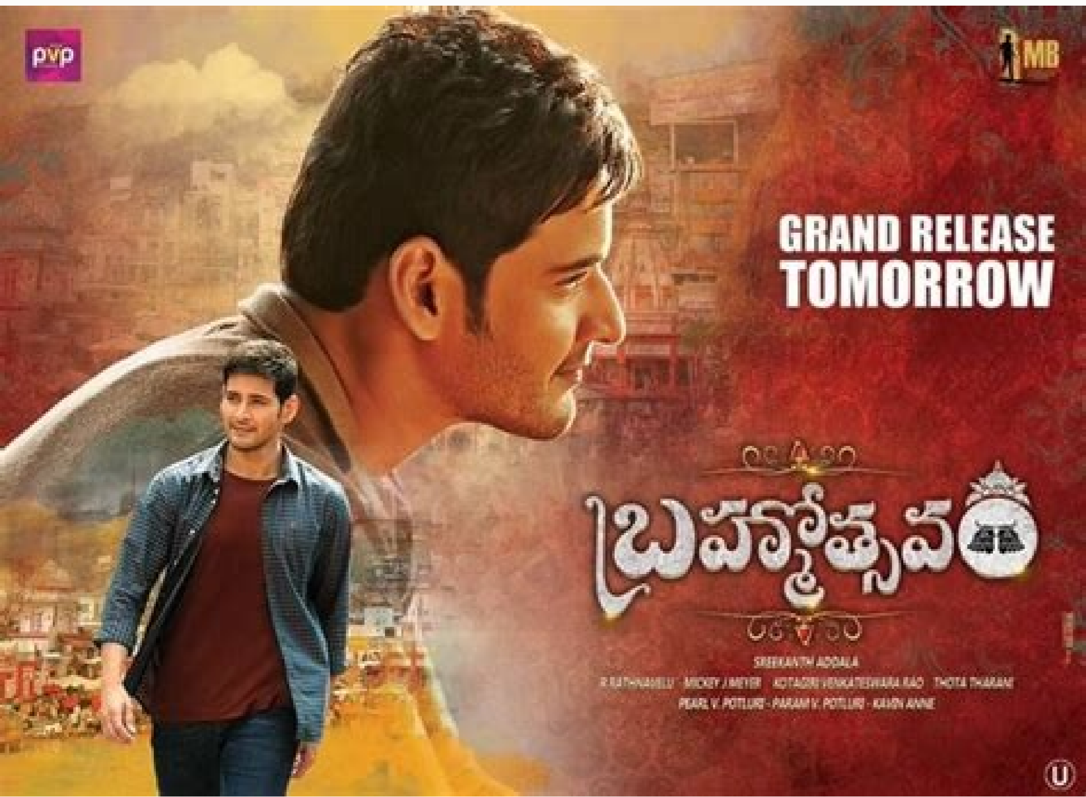
Brahmotsavam full video songs. Brahmotsavam movie songs in telugu.